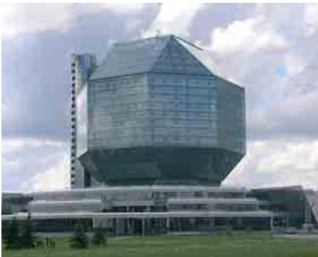
The new National Library symbolizes Belarus' drive for innovation in education, design and technology.