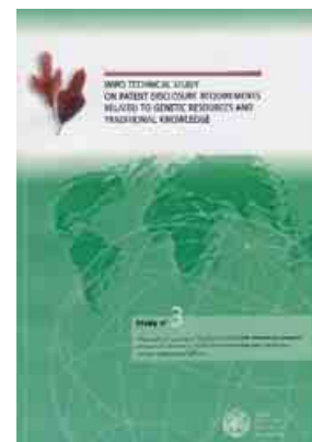
The CBD has commissioned two detailed studies from WIPO.

As with the other issues discussed in this series of articles, policymakers are weighing the boundaries and linkages between bioethical questions and legal measures, including IP laws. These articles have sought to flag up some of these much-debated issues, while recognizing the diversity of views that are brought to these important, ongoing debates.