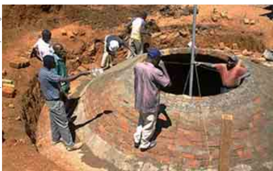
The biogas project at Moi University Holdings Ltd. aims to treat waste and waste water from the agricultural sector in order to generate energy for heating and lighting. The treated water can also be used for irrigation.