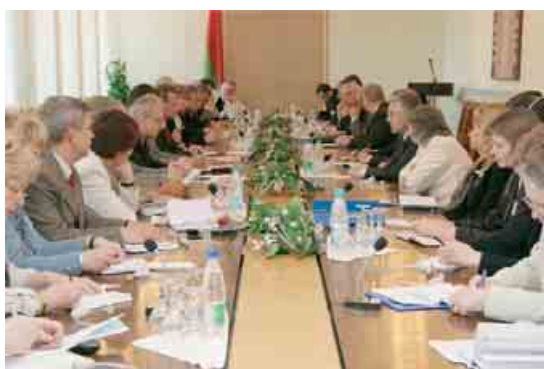
Roundtable discussions at the International Conference on IP Education and Training held in May.

The joint IP education programs developed by WIPO and NCIP received fresh impetus in May when WIPO and the Eurasian Patent Organization held an international conference on IP education and training in Minsk. The event attracted 300 participants from more than 20 countries to discuss the development of human resources as a means of stimulating innovative activity and the current state of IP education and training. The conference defined the new standards required in IP education