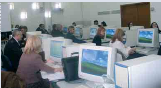
At a workshop in Skopje, University IP Coordinators from Macedonia, Albania, Bosnia and Herzegovina, Croatia, Serbia and Montenegro discover how to use free online databases to conduct basic patent searches.

The coordinators have worked jointly to put together a set of IP teaching materials and guidelines, drawing on the information package provided by WIPO. At the Rudjer Boskovic Institute, a coordination mechanism has been established between the technical faculties and commercial and legal departments in order to improve information and assistance available to scientific staff.