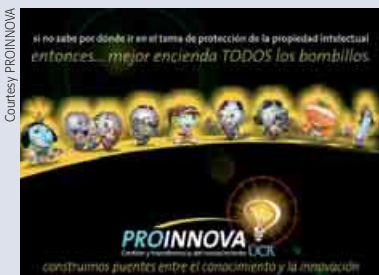
A poster campaign by the University of Costa Rica's PROINNOVA office, a participant in the WIPO University Initiative program, encourages researchers to think IP.

The WIPO University Initiative is one of several WIPO programs which encourages universities and R&D institutions in developing countries to create, protect and exploit IP assets. Participating institutions are provided with a set of IP reference materials, and a University IP Coordinator is designated in each institution to disseminate information and advice on IP matters to students and staff.