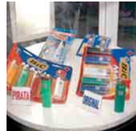
Media coverage of police raids reinforces the message that piracy doesn't pay.

schedules of the 2006 World Cup championship, a key advertising medium in football-crazy Brazil. The schedules bore the anti-piracy slogan and the national team's trademark yellow and green colors. The campaign is continuing in fairs and popular events around the country, and will soon be extended to primary and secondary schools, colleges and universities.