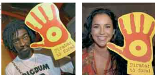
Launched at the Salvador de Bahia Carnival, the campaign has proved a big hit.

In parallel, the government cut taxes in several sectors. Legislation introduced in November 21, 2005, for example, granted tax benefits for computer products to be sold at popular prices.