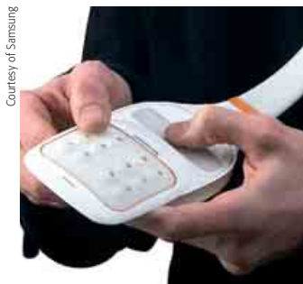
Samsung's Touch Messenger enables blind users to send text messages in Braille.