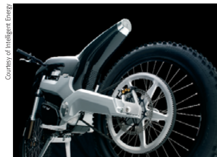
Intelligent Energy's Emission Neutral Vehicle – based on hydrogen fuel cell technology.

purpose-built from the ground up, and demonstrates the applicability of hydrogen fuel cell technology for everyday use. The Core, which is completely detachable from the bike, is a compact and efficient fuel cell, which Intelligent Energy say is capable of powering anything from a motorboat to a small household.