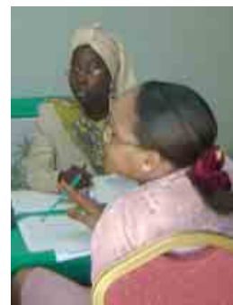
Teams review the licensing deals they have struck in Successful Technology Licensing training exercises in Geneva and Dakar, Senegal.

grams include assistance to developing country universities seeking to put in place IP policy frameworks (see also pages 12-14); training in patent drafting to plug critical skills gaps; and studies, such as those commissioned by WIPO in seven Asian countries, to help analyze how issues of technology