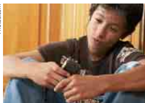
More choice for legal down-loaders

Kazaa, the peer-to-peer (P2P) digital file sharing Internet service, is moving to a legal model. The Australian court had ruled against them in 2005, finding Sharman Networks, its parent company, guilty of inciting users to swap music illegally – a breach of copyright law. The U.S. Supreme Court ruled that Internet companies could be held accountable for promoting copyright theft by users of their services. So following the move of its predecessor, Napster, Kazaa will make the switch to licensed distribution of music and movies.