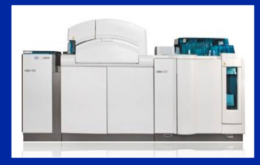
Clinical Chemistry Testing