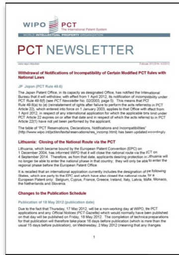
The changing faces of the PCT Newsletter (1994, 2003, 2012)