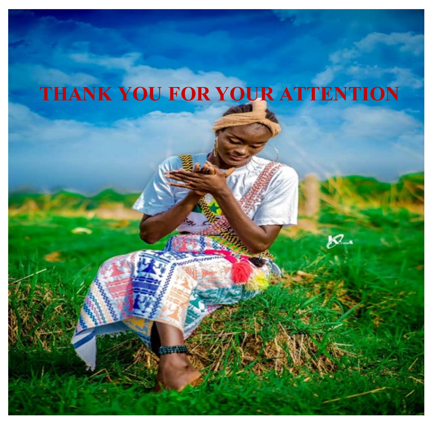
WIPO FOR OFFICIAL USE ONLY