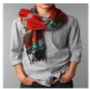
Wide Navajo Scarf $29.00