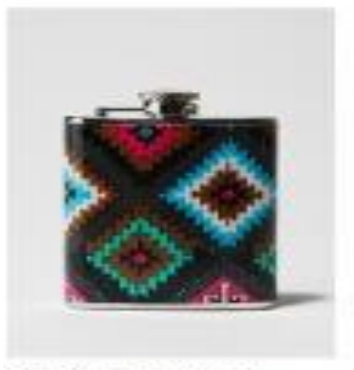
Navajo Print Fabric Wrapped Flask