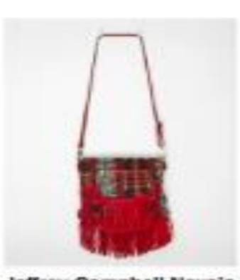
Jeffrey Campbell Navajo Fringe Crossbody Bag