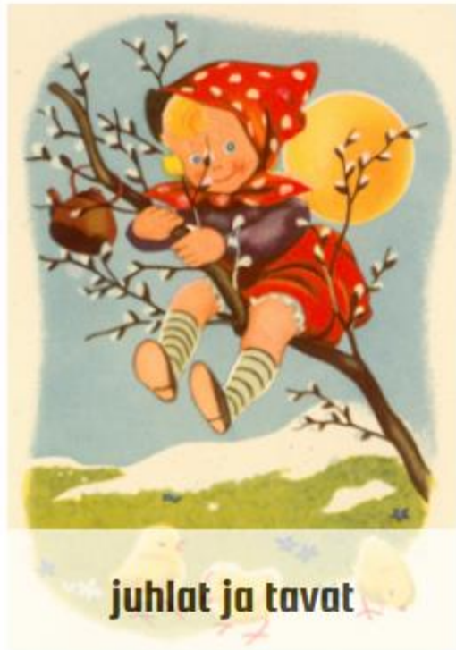
juhlat ja tavat