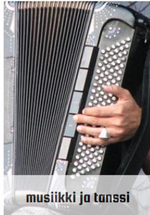
musiikki ja tanssi