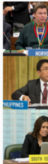
Delegates attending the Intergovernmental Committee on Intellectual Property and Genetic Resources, Traditional Knowledge and Folklore (IGC) meeting.

Looking for information on the IGC? IGC website | IGC: What is happening now