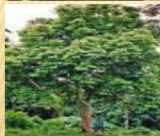
Mature Canarium plant, Vanuatu (Thomson & Evans, 2006)