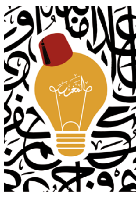
42 SMEs in Argentina and 26 in Morocco were selected to participate in the pilot project.