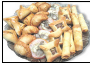
Mini pieces oriental