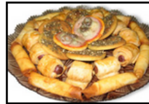
Mini pieces oriental