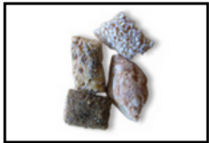
Salted mini pieces