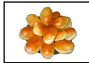
Mini Pain Au lait sandwiches