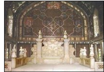
IRAN'S KORDESTAN MARBLE (AO1105 / Iran)