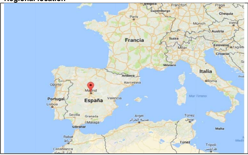
Spain and neighboring States