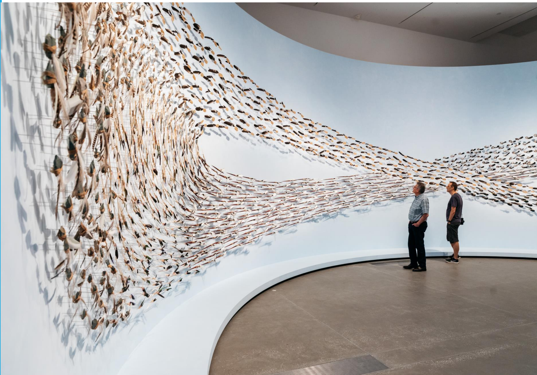
Untitled, giran 2018 © Jonathan Jones