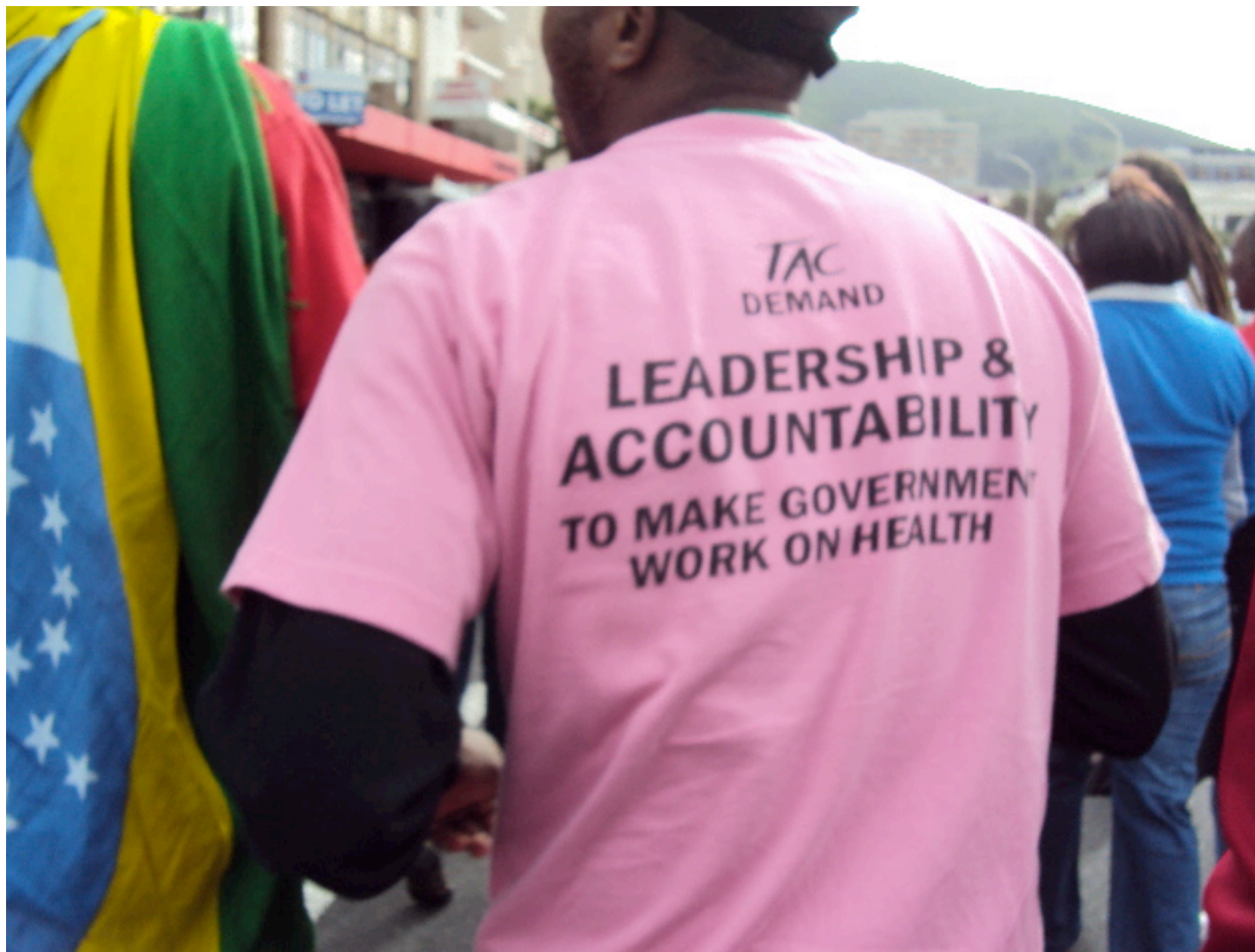
3rd People's Health Assembly, Cape Town, July 2012