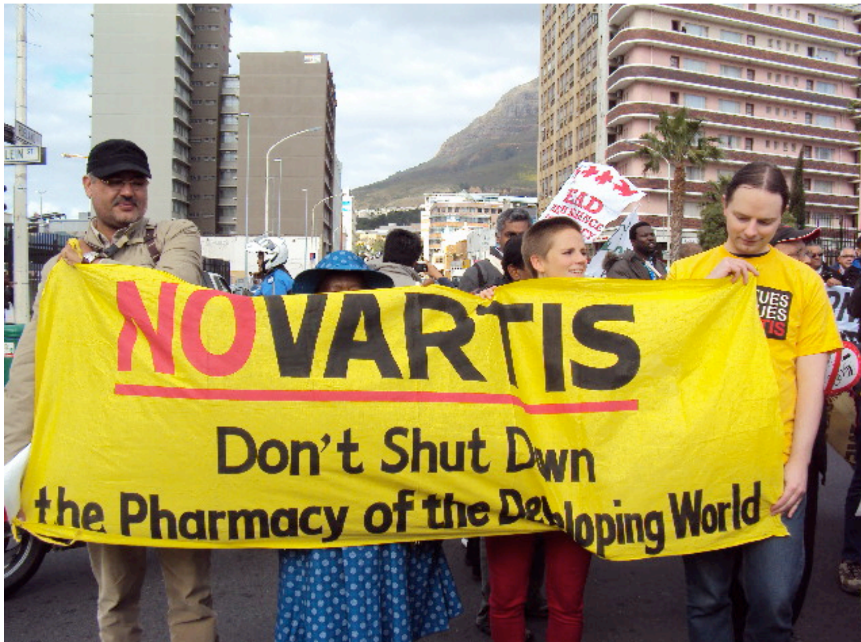
3rd People's Health Assembly, Cape Town, July 2012