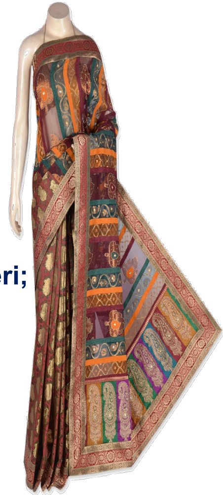
Chanderi Silk Saree