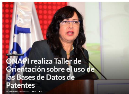
ONAPI realiza Taller de Orientación sobre el uso de las Bases de Datos de Patentes

http://elverificador.com/2018/08/onapi-realiza-taller-de-orientacion-sobre-el-uso-de-las-bases-de-datos-de-patentes/