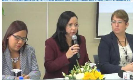
Celebraron un taller de orientación sobre el uso de bases de datos

http://www.cdn.com.do/2018/08/14/onapi-motiva-innovacion-tecnologica-avance-sector-economico-rd/