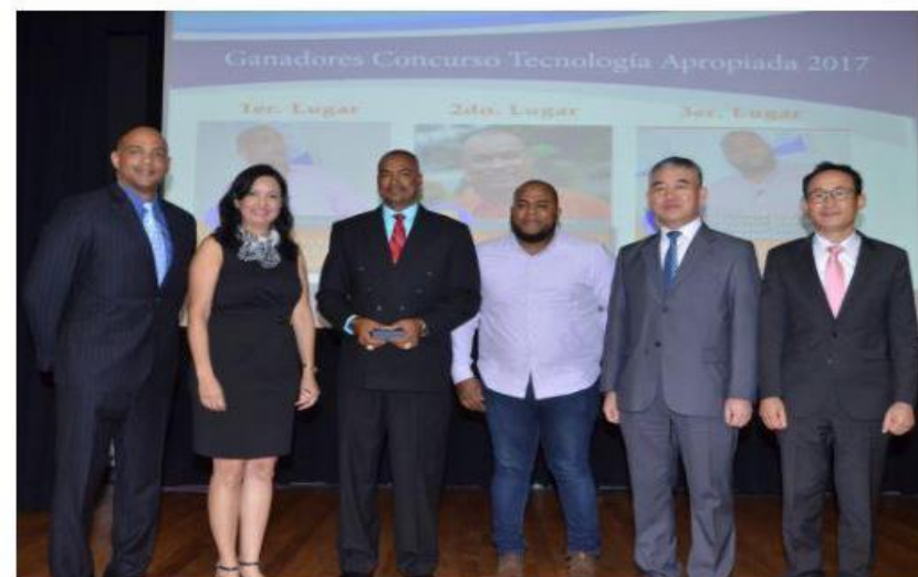
SANTO DOMINGO, República Dominicana. – Jóvenes innovadores se destacaron en la competencia de tecnología apropiada, auspiciada en el país por Corea del Sur y en la que se anunciaron tres proyectos ganadores, seleccionados de 142 propuestas.

http://elverificador.com/2018/08/onapi-realiza-taller-de-orientacion-sobre-el-uso-de-las-bases-de-datos-de-patentes/