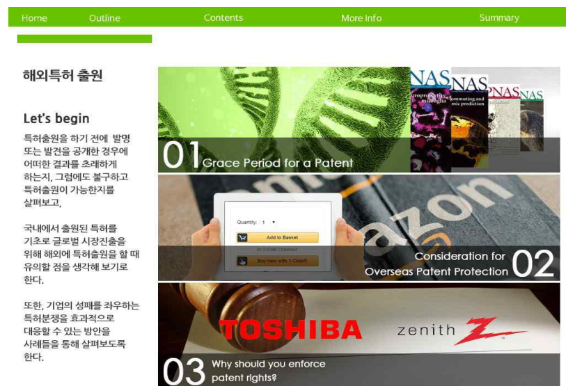
<IP Panorama mobile (IP Insight)>