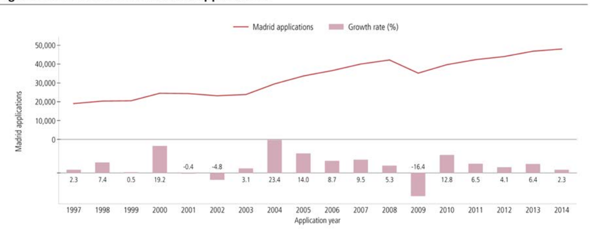
Figure A.1.1 Trend in international applications