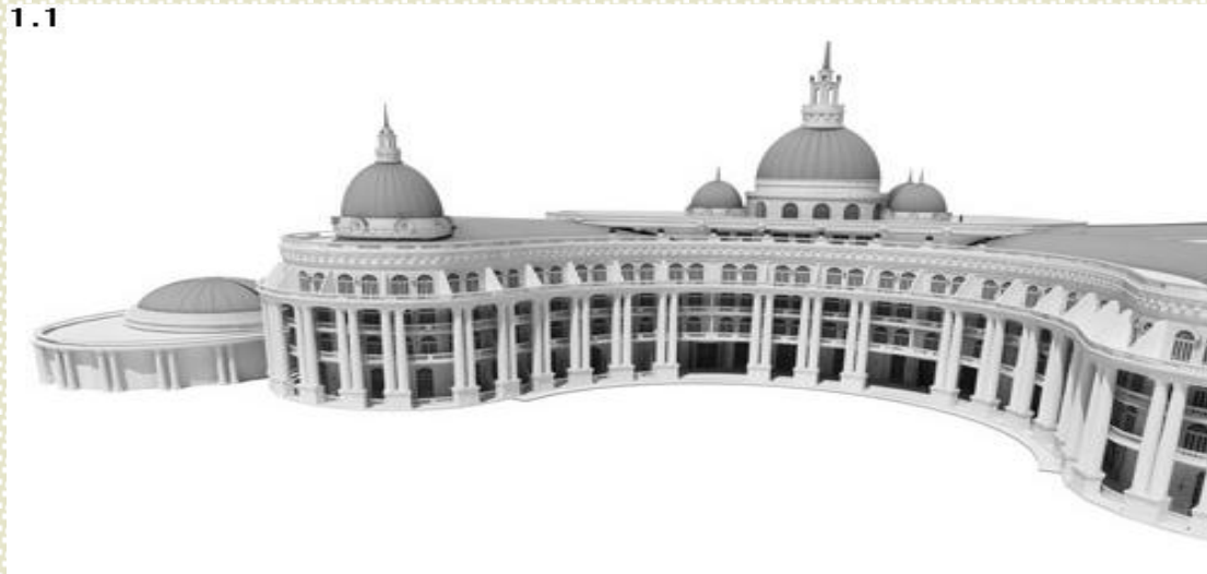
Hotel building complex (Example from the International Designs Bulletin)