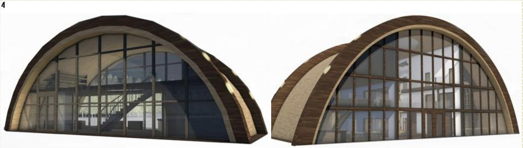
Buildings (Example from the International Designs Bulletin)