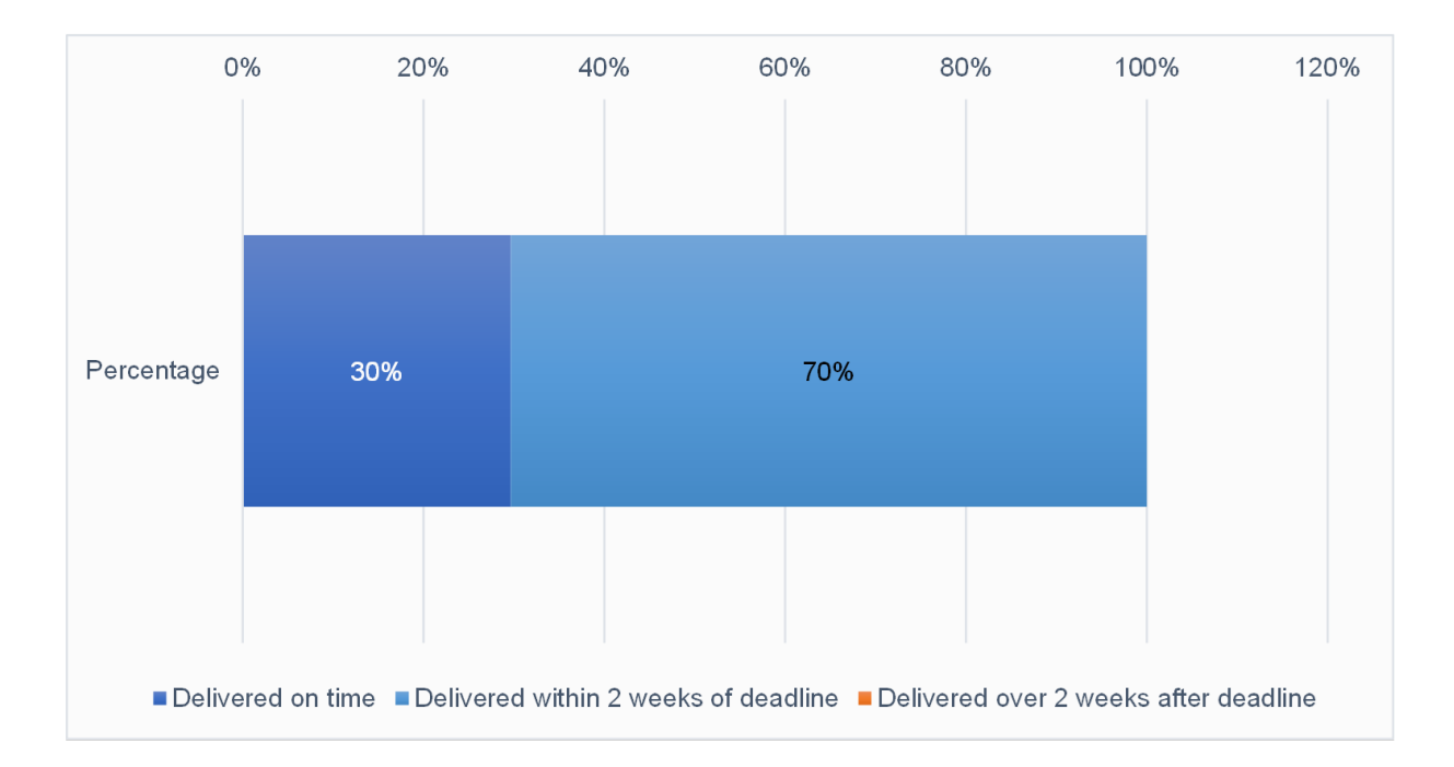
Chart 1 Summary Dashboard – Response Timeliness

8. It is highlighted that in addition to the follow up of outstanding JIU recommendations, the Secretariat continues its work to facilitate and coordinate responses to the JIU's questionnaires, surveys and interviews in relation to ongoing and new Reviews in a timely manner (see Summary Dashboard – Response Timeliness table below).