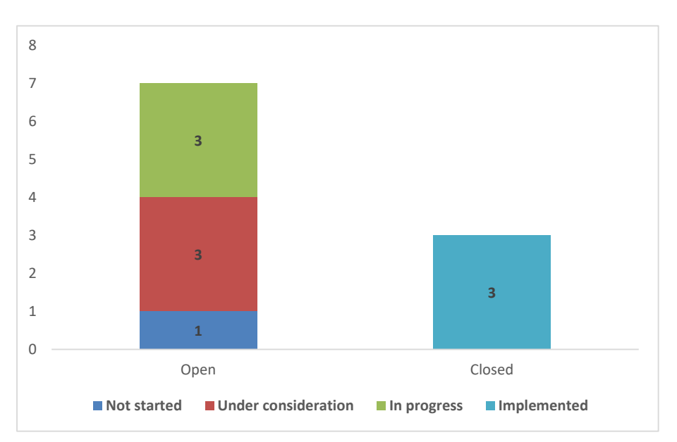
Chart 2 JIU Recommendations addressed to Legislative Bodies Status as at February 29, 2024

10. As at February 29, 2024, subject to the endorsement of Member States in respect of recommendations contained in the present report, there will be seven recommendations addressed to WIPO's Legislative Bodies and ten recommendations addressed to the Executive Head, which remain outstanding. All other recommendations have been closed (implemented, considered not relevant to WIPO, or not accepted).