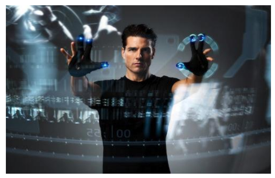
Minority Report Movie, 2002

Brain-Computer Interface Flexible OLED display Augmented Reality (AR) Voice User Interface (VUI) Tangible User Interface (TUI) Wearable Computer Sensor Network User Interface (SNUI)