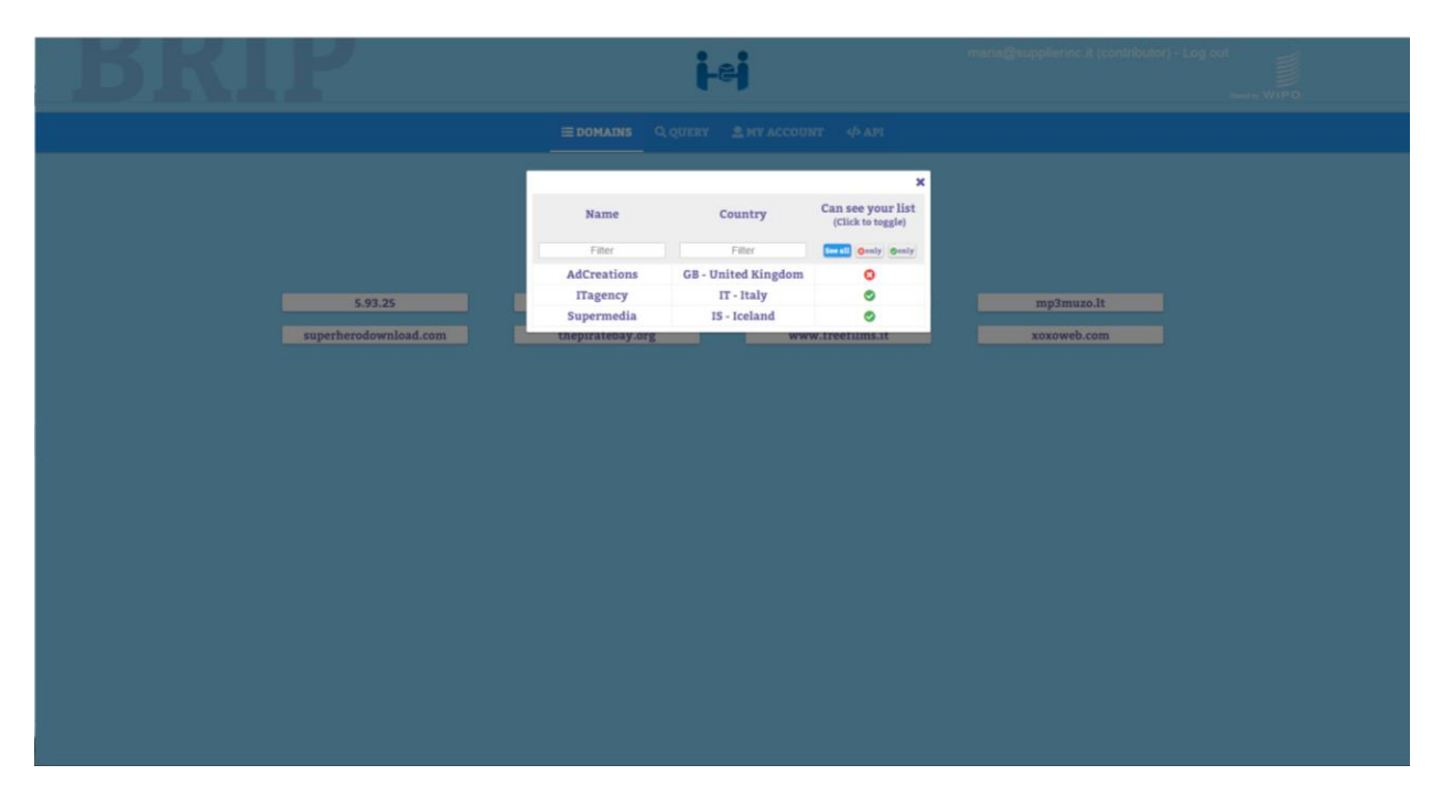
Figure 3: Authorized Contributor's tool to block access by particular Authorized Users

20. An Authorized User logs in in the same way as an Authorized Contributor, but cannot add or remove domains from the database. An Authorized User can check whether a domain has been listed on the platform by entering it manually or consulting the database automatically via the API.