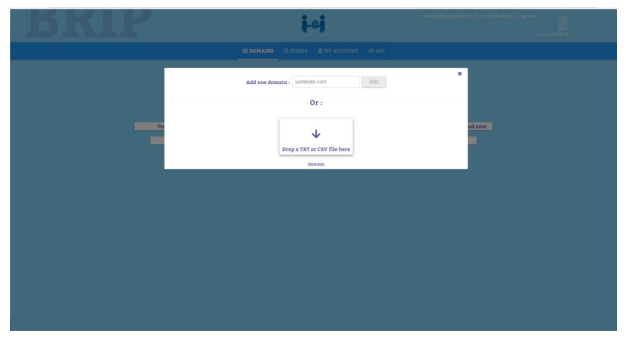
Figure 2: Contributor's tool to add URLs to a national list