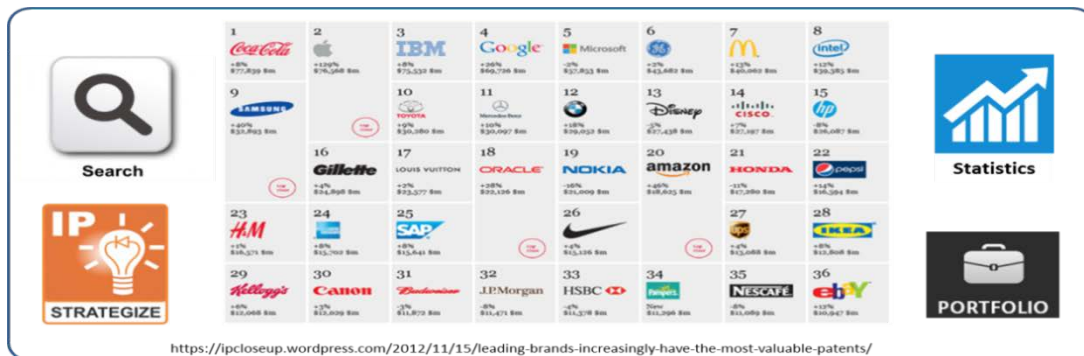
Figure 2. Usage of Standardized Applicant Name

Standardized applicant names are useful for search-related, analytical, statistical, and administrative purposes. For example, the center picture in Figure 2 shows the top 36 brands over the world, and it highlights the fact that many of these brands, including Apple, Samsung, Oracle, and Amazon, own valuable patents. KIPO believes that a unified applicant name database would be useful for analyses because inconsistencies in applicant names impede an accurate assessment of the patents owned by a given applicant.