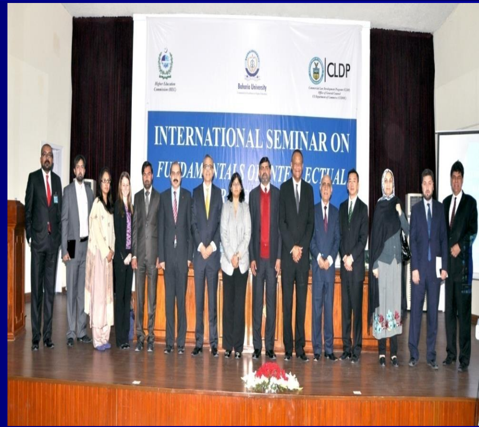
Group Photo with Distinguished Guests at Seminar