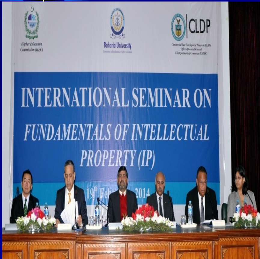
Distinguished speakers are seated along with Pro-Rector at Seminar