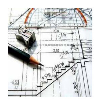
DELIVERING INFRASTRUCTURE PROJECTS

Grow Micro Businesses and Strengthen Local Enterprises towards Internationalisation.