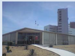
Center Regional Office PUEBLA