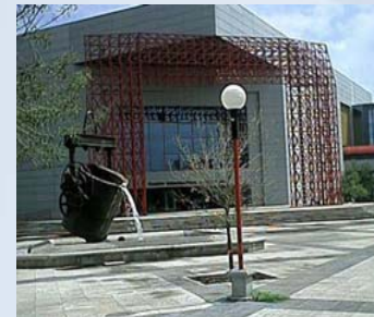
Northern Regional Office MONTERREY