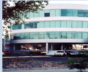
"Bajío" Regional Office LEON