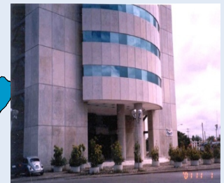
Southeastern Regional Office MERIDA