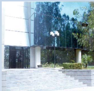
Western Regional Office GUADALAJARA