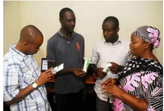
TISC RESEARCHERS, 2014

TISC is a good platform to use for creating awareness within and outside Nigeria about Registration of Patents and Designs. Unfortunately, it is yet to be adequately replicated in host institutions of Scientific Research and Development nation wide, due to budgetary constraints.