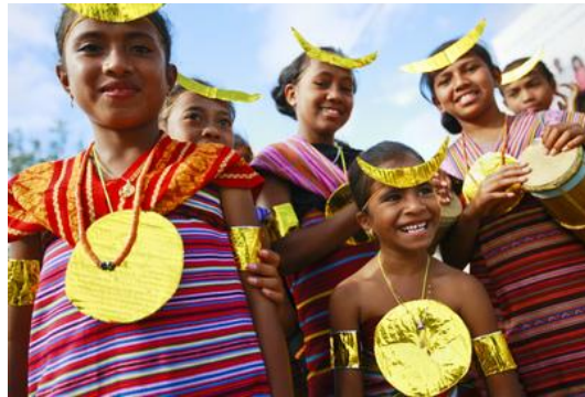
Timorese in traditional dress take part in a ceremony