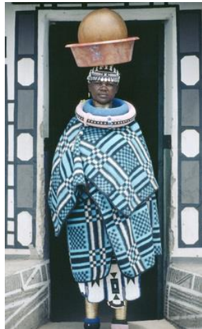
A woman from the Ndebele tribe carries a traditional beer container