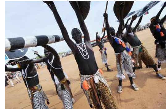
Traditional dancers perform during the pre-independence march and rally of the Sudan People's Liberation Movement