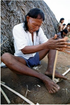
Shavante Indians using Buriti sticks to make a fire