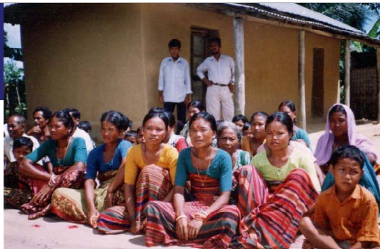
Development Initiative for Inclusive People (DIIP) is a non-profit, non-political, non-government voluntary and charitable organization, a sister organization of OSAD