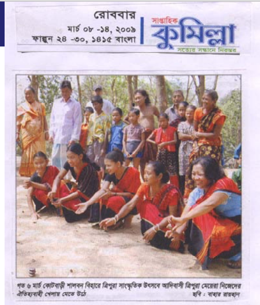
A three-day long 'Tripura Tribal New Year Festival' was celebrated in Tripura Para at Shalban Bihar, Kotbari, Comilla