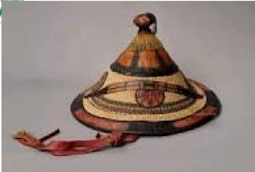
Chapeau de Sapone