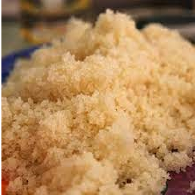
Attieké des Lagunes