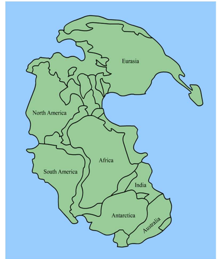
Map of Pangaea