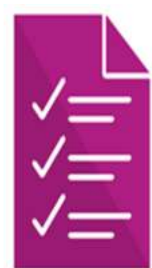
马德里商品和服务管理器