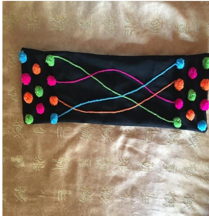
Pencils cases made from the cut offs of the Denim material