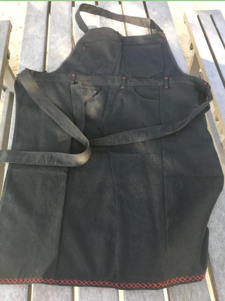
Figure 1: Counterfeit Levi Jeans worked into Aprons