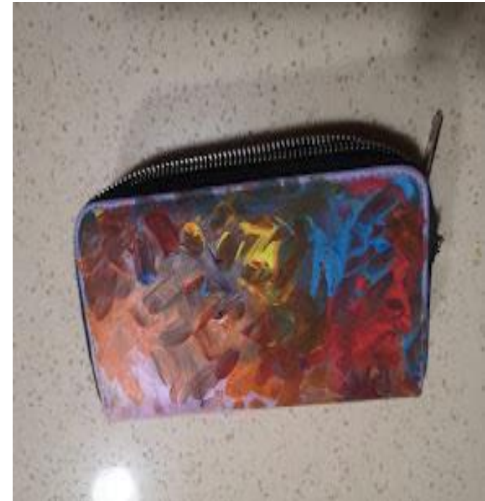
Counterfeit Louis Vuitton purse reworked