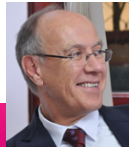
FRANCIS GURRY DIRECTOR GENERAL WORLD INTELLECTUAL PROPERTY ORGANIZATION

I welcome the delegates from WIPO to Australia, and hope you can take away some useful information from this special seminar event.