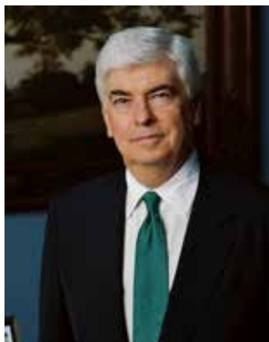
Senator Chris Dodd

Former United States Senator Chris Dodd is the Chairman and CEO of the Motion Picture Association of America, Inc., which serves as the voice and advocate of one of the United States’ most creative and storied industries around the world. Appointed in March 2011, Senator Dodd’s highest priority is championing the creative freedoms of filmmakers by safeguarding intellectual property rights, advancing technology-driven innovation and opening global markets to the uniquely powerful mediums of film and television.