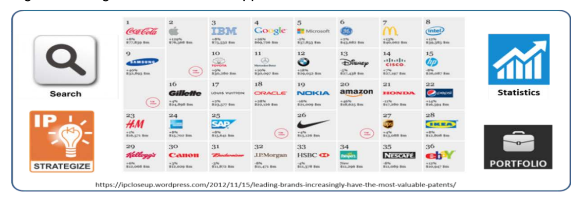
Figure 2. Usage of Standardized Applicant Name

Standardized applicant names are useful for search-related, analytical, statistical, and administrative purposes. For example, the center picture in Figure 2 shows the top 36 brands over the world, and it highlights the fact that many of these brands, including Apple, Samsung, Oracle, and Amazon, own valuable patents. KIPO believes that a unified applicant name database would be useful for analyses because inconsistencies in applicant names impede an accurate assessment of the patents owned by a given applicant.