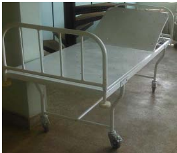
Medical Equipment – Hospital beds

The RTI has undertaken over 150 projects of which 30% have been successfully completed whereas the rest are ongoing. Notable products developed include: