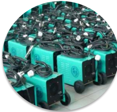
Fabrication Equipment – Arc Welding