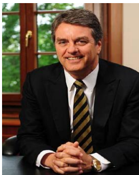
Robert AZEVÊDO, Director-General, World Trade Organization (WTO)